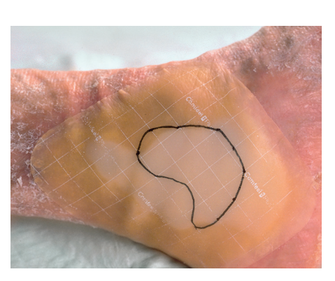
Wound size mapping and dressing change indication (gelling) help decide time for change